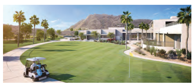
*RENDERING FOR ILLUSTRATION PURPOSES