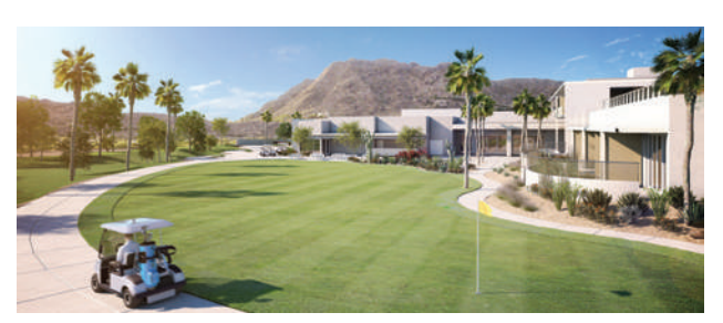
*RENDERING FOR ILLUSTRATION PURPOSES