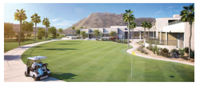
*RENDERING FOR ILLUSTRATION PURPOSES